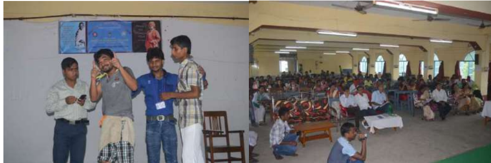
Drama being played by the active NSS volunteers at College Auditorium on 21.06.17 i.e., International Yoga Day and the audience enjoying it.