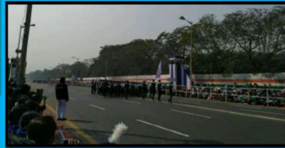
Five above volunteers of this College got selected to parade at Red Road during Republic Day Parade 2017 (on 26.01.17) at Kolkata.