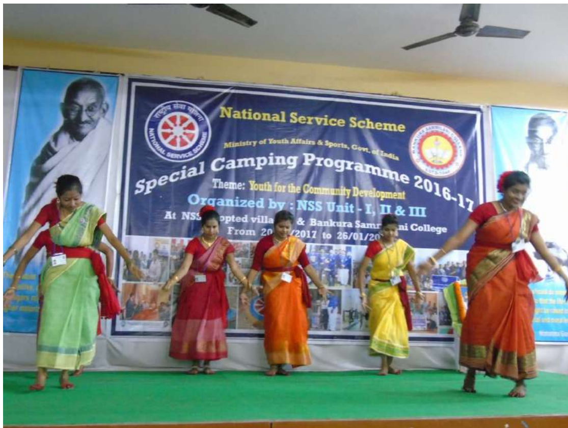
Cultural programme during the inaugural session of the Special Camping Programme.

Action photographs of Special Camping Programme from 20 to 26.01.2017 at NSS Adopted village and College Campus as well are as follows: