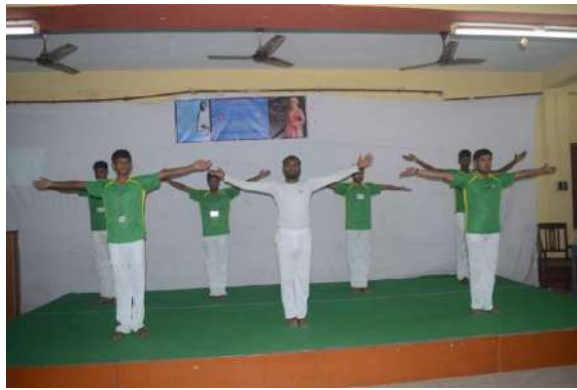
On 21.06.17 the NSS volunteers celebrated International Yoga Day