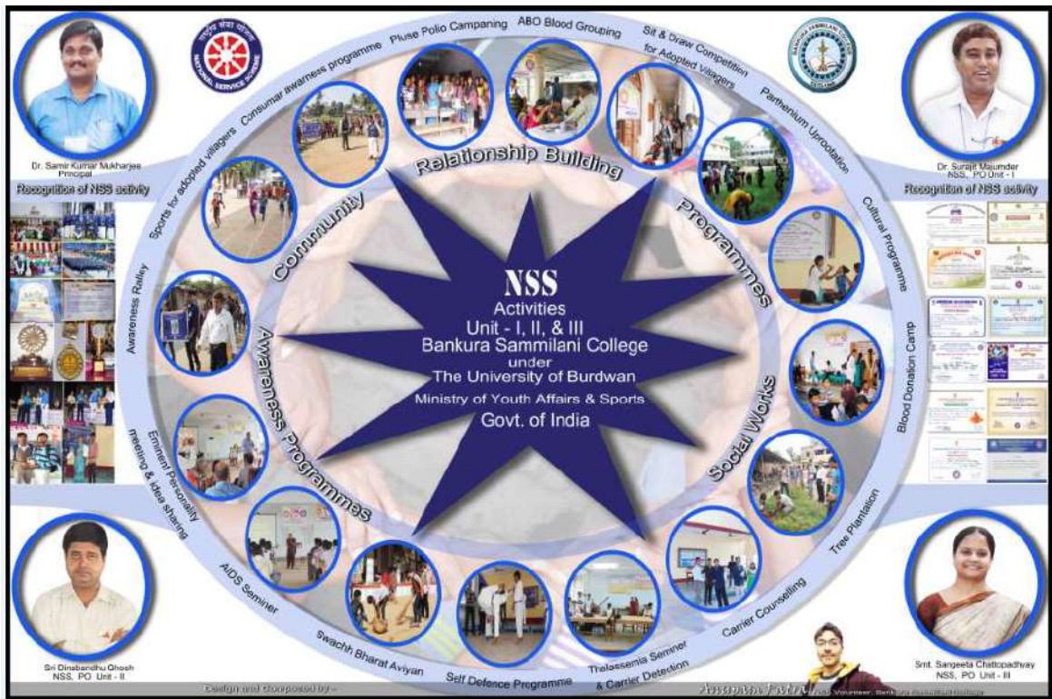
Multidisciplinary work done by the NSS Units of Bankura Sammilani College, Kenduadihi, Bankura