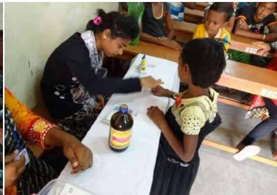
As a part of Red Ribbon Club programme necessity of ABO Blood grouping was discussed among the NSS Adopted villagers on 06.08.2016 at Bankura Sammilani College.